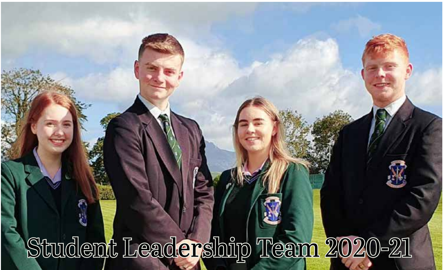
Student Leadership Team 2020-21